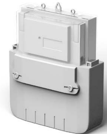
In electricity meters casting resins with good adhesive qualities, flame resistance and low viscosity are required.

Wevo casting, bonding and sealing systems ensure lasting meter accuracy and durability in millions of households.